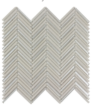
Breeze Herringbone ANTHSEBRHB 10"x10" Coverage: 0.727 sqft/pc