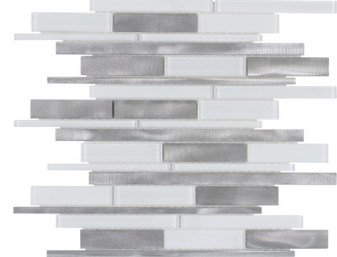
CycloneLightningANTHSECY* 12"x15"ANTHSELI* 12"x15"Coverage: 0.984 sqft/pcCoverage: 0.984 sqft/pc