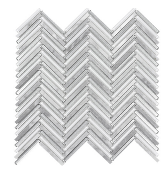
Frost Herringbone ANTHSEFRHB 10"x10" Coverage: 0.727 sqft/pc

Frost 4x8 ANTHSEFR48 Coverage: 0.215 sqft/pc *sold by the box