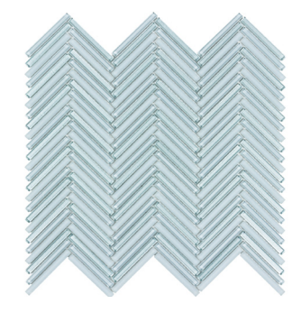
Celestial Herringbone ANTHSECEHB 10"x10" Coverage: 0.727 sqft/pc

Celestial 4x8 ANTHSECE48 Coverage: 0.215 sqft/pc *sold by the box