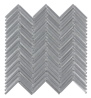
Wind Herringbone ANTHSEWIHB 10"x10" Coverage: 0.727 sqft/pc

Frost 4x8 ANTHSEFR48 Coverage: 0.215 sqft/pc *sold by the box