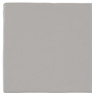
Habitat 5X5 ANTHAIH 5.11" x 5.11" Coverage: 0.181 sqft/pc *sold by the box