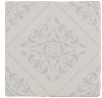
Dali Juniper ANTHAIDJ 5.11" x 5.11" Coverage: 0.181 sqft/pc *sold by the box