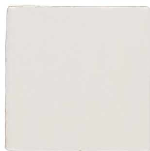
Lace 5X5 ANTHAIL 5.11" x 5.11" Coverage: 0.181 sqft/pc *sold by the box