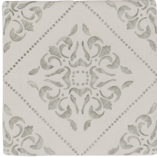
Dali Habitat ANTHAIDH 5.11" x 5.11" Coverage: 0.181 sqft/pc *sold by the box