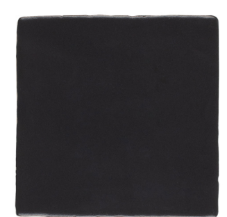
Moonstone 5X5 ANTHAIM 5.11" x 5.11" Coverage: 0.181 sqft/pc *sold by the box