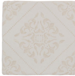
Dali Honeypot ANTHAIDHP 5.11" x 5.11" Coverage: 0.181 sqft/pc *sold by the box