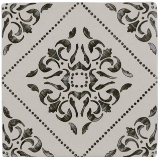
Dali Moonstone ANTHAIDM 5.11" x 5.11" Coverage: 0.181 sqft/pc *sold by the box