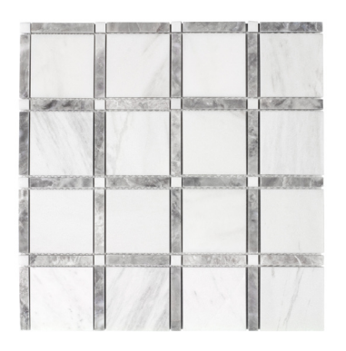
Fortress ANTHCAFO 12"x12" Coverage: 1.01 sqft/pc