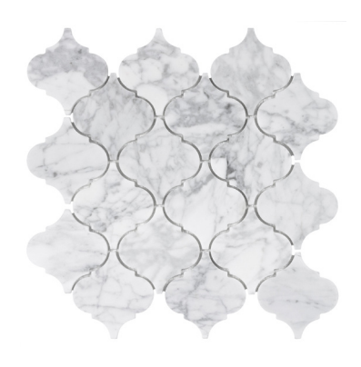
Medina ANTHCAME 13"x13" Coverage: 0.9 sqft/pc