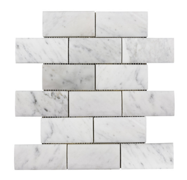
Villa ANTHCAVI 12"x12" Coverage: 0.80 sqft/pc