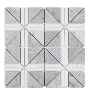
Jardin ANTHCAJA 12"x12" Coverage: 0.969 sqft/pc