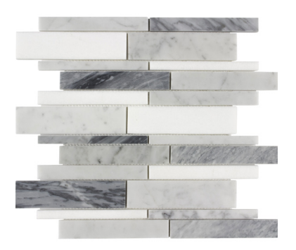
Gallerie 38 ANTHCAGA 12"x14 Coverage: 1 sqft/pc