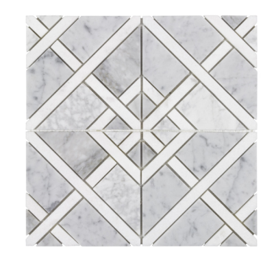
Fez ANTHCAFE 12"x12" Coverage: 0.969 sqft/pc