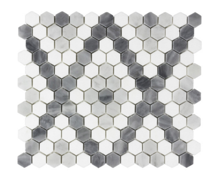
Kasbah ANTHCAKA 12"x12" Coverage: 0.84 sqft/pc