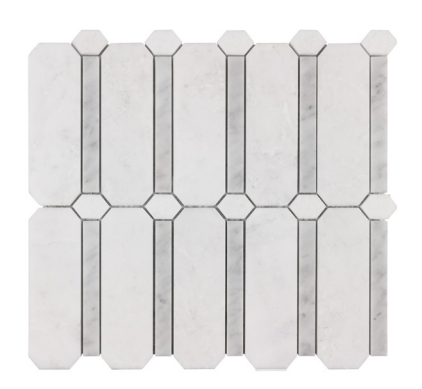
King's Place ANTHCAKP 12"x12" Coverage: 0.976 sqft/pc