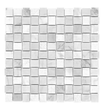
Parc Mosaic ANTHCAPM 12"x12" Coverage: 0.969 sqft/pc