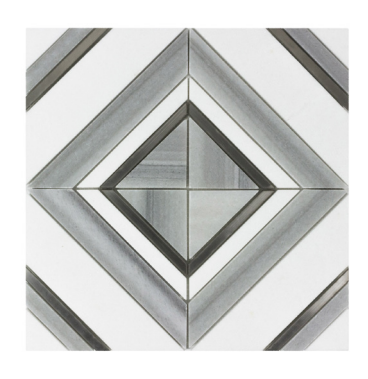
Central Square ANTHCACS 12"x12" Coverage: 0.995 sqft/pc