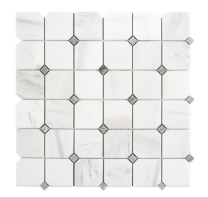
Legacy ANTHCALE 12"x12" Coverage: 0.96 sqft/pc