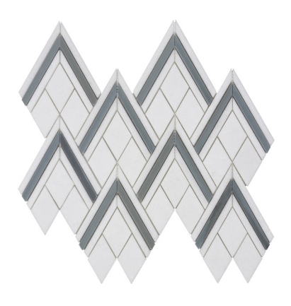
Sahara ANTHCASA 14"x14" Coverage: 0.96 sqft/pc