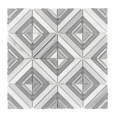
Taza ANTHCATA 12"x12" Coverage: 0.995 sqft/pc