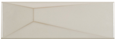
Manhattan Haze ANTHFIMH 4"x12" Coverage: 0.323 sqft/pc *sold by the box