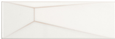
Manhattan Cloud ANTHFIMC 4"x12" Coverage: 0.323 sqft/pc *sold by the box