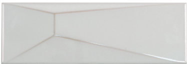
Manhattan Dove ANTHFIMD 4"x12" Coverage: 0.323 sqft/pc *sold by the box