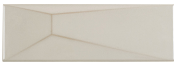
Manhattan Haze ANTHFIMH 4"x12" Coverage: 0.323 sqft/pc *sold by the box