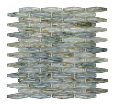
Stakes Lagoon ANTHGLSL 12"x12" Coverage: 0.984 sqft/pc