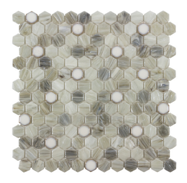
Brocade Sepia ANTHGLBRS 12"x12" Coverage: 0.963 sqft/pc