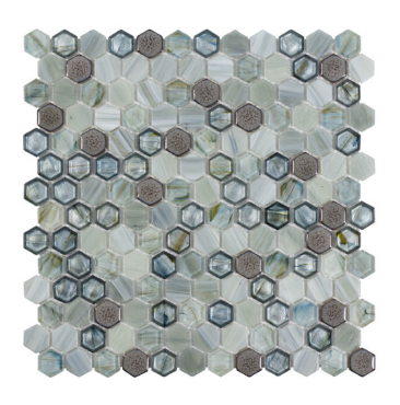
Brocade Lagoon ANTHGLBRL 12"x12" Coverage: 0.963 sqft/pc