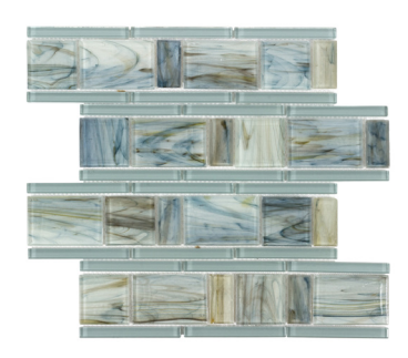
Interlude Lagoon ANTHGLIL 12"x13" Coverage: 1.0369 sqft/pc