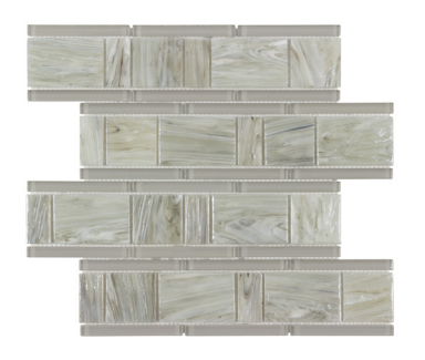
Interlude Sepia ANTHGLIS 12"x13" Coverage: 1.0369 sqft/pc