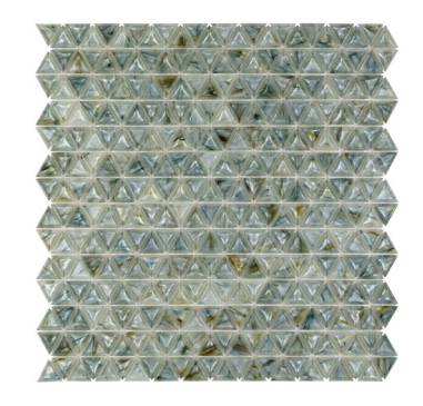
Mini Triangle Lagoon ANTHGLMTL 12"x12" Coverage: 1.034 sqft/pc