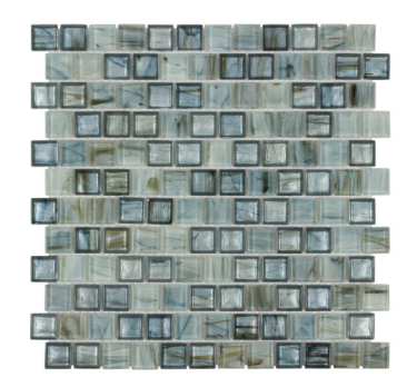
Rhapsody Lagoon ANTHGLRL 12"x12" Coverage: 0.952 sqft/pc