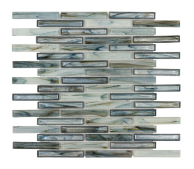
Beam Lagoon ANTHGLBL 12"x12" Coverage: 0.963 sqft/pc