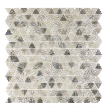
Mini Triangle Sepia ANTHGLMTS 12"x12" Coverage: 1.034 sqft/pc