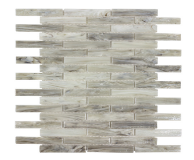
Beam Sepia ANTHGLBS 12"x12" Coverage: 0.963 sqft/pc