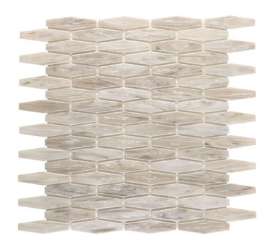
Stakes Sepia ANTHGLSS 12"x12" Coverage: 0.984 sqft/pc