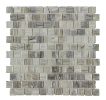
Rhapsody Sepia ANTHGLRS 12"x12" Coverage: 0.952 sqft/pc