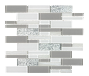
Urban Sky ANTHMDUS 12"x12" Coverage: 0.98 sqft/pc