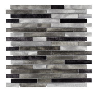
Highrise ANTHMDHI 12"x13" Coverage: 0.98 sqft/pc