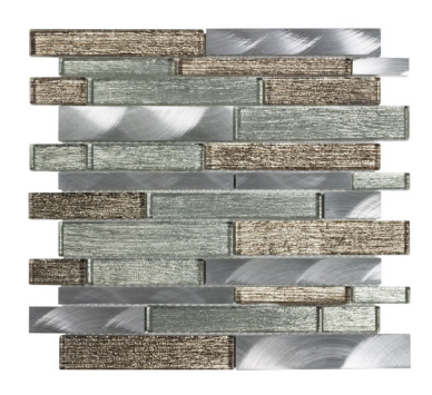
Skyrise ANTHMDSK 12"x13" Coverage: 0.95 sqft/pc