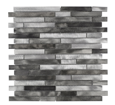
Silverscape ANTHMDSI 12"x13" Coverage: 0.98 sqft/pc