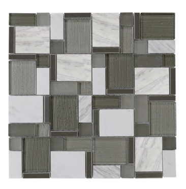
Cityscape ANTHMDCI 12"x12" Coverage: 0.969 sqft/pc