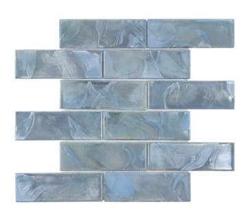
Astral ANTHMGAS 12"x12" Coverage: 1.06 sqft/pc