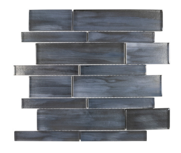
Horizon Mix ANTHMGHM 12"x12" Coverage: 0.97 sqft/pc