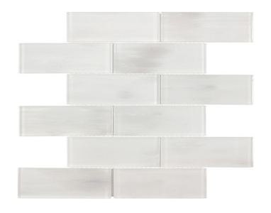
Tradewind Mix ANTHMGTM 12"x12" Coverage: 0.97 sqft/pc