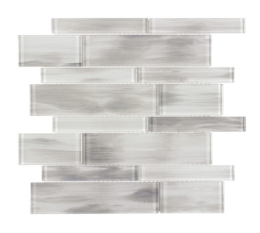
Whirlwind Mix ANTHMGWM 12"x12" Coverage: 0.97 sqft/pc