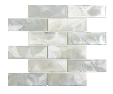
Cosmic ANTHMGCO 12"x12" Coverage: 1.06 sqft/pc