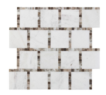
Pebble Ridge ANTHRHPR 13"x13" Coverage: 1.102 sqft/pc