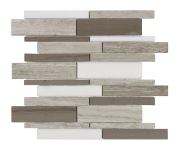
Villager ANTHRHVI 12"x14" Coverage: 1 sqft/pc