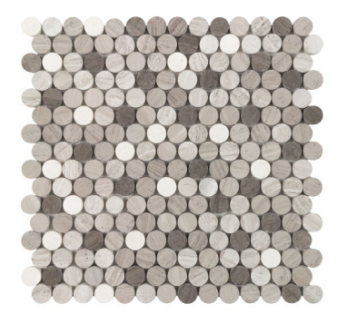
Ridge Rounds ANTHRHRR 11.5"x11.62" Coverage: 0.928 sqft/pc