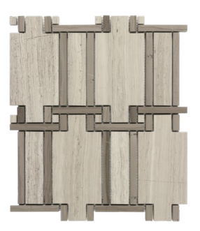
Edgewood Hills ANTHRHEH 10"x12" Coverage: 0.852 sqft/pc