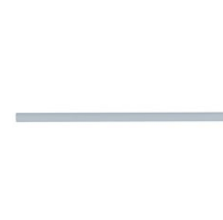
Juniper Pencil Liner ANTHAIJPL 0.47" x 11.81" *sold by the box