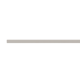
Habitat Pencil Liner ANTHAIHPL 0.47" x 11.81" *sold by the box