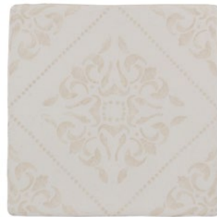
Dali Honeypot ANTHAIDHP 5.11" x 5.11" Coverage: 0.181 sqft/pc *sold by the box