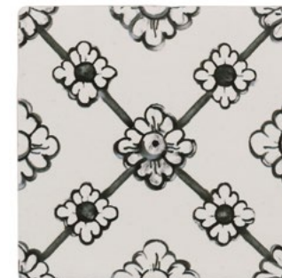
Matisse Moonstone ANTHAIMM 5.11" x 5.11" Coverage: 0.181 sqft/pc *sold by the box