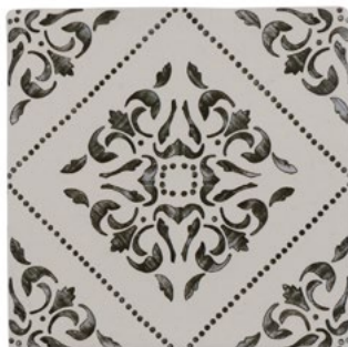
Dali Moonstone ANTHAIDM 5.11" x 5.11" Coverage: 0.181 sqft/pc *sold by the box