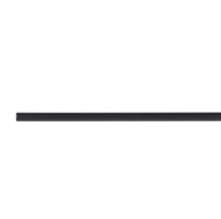
Moonstone Pencil Liner ANTHAIMPL 0.47" x 11.81" *sold by the box