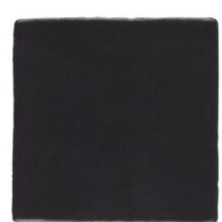
Moonstone 5X5 ANTHAIM 5.11" x 5.11" Coverage: 0.181 sqft/pc *sold by the box