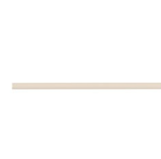
Honeypot Pencil Liner ANTHAIHPPL 0.47" x 11.81" *sold by the box