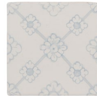
Matisse Juniper ANTHAIMJ 5.11" x 5.11" Coverage: 0.181 sqft/pc *sold by the box