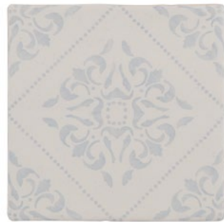
Dali Juniper ANTHAIDJ 5.11" x 5.11" Coverage: 0.181 sqft/pc *sold by the box