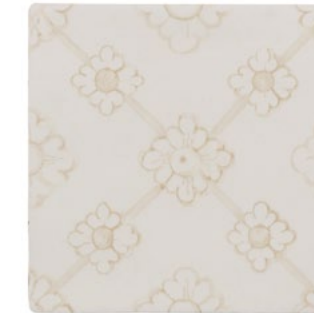
Matisse Honeypot ANTHAIMHP 5.11" x 5.11" Coverage: 0.181 sqft/pc *sold by the box