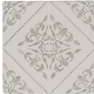
Dali Habitat ANTHAIDH 5.11" x 5.11" Coverage: 0.181 sqft/pc *sold by the box