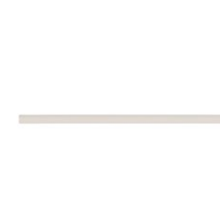
Lace Pencil Liner ANTHAILPL 0.47" x 11.81" *sold by the box