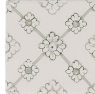
Matisse Habitat ANTHAIMH 5.11" x 5.11" Coverage: 0.181 sqft/pc *sold by the box